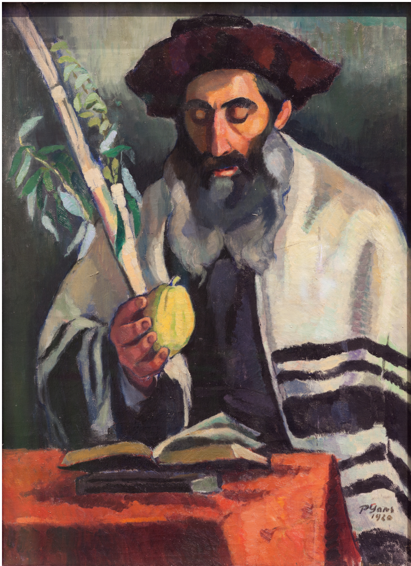
Abb. 4: Paula Gans (1883–1941): Im Gebet beim Laubhüttenfest. Öl auf Leinwand. 86 × 62,5 cm. 1920. Museum für Hamburgische Geschichte.