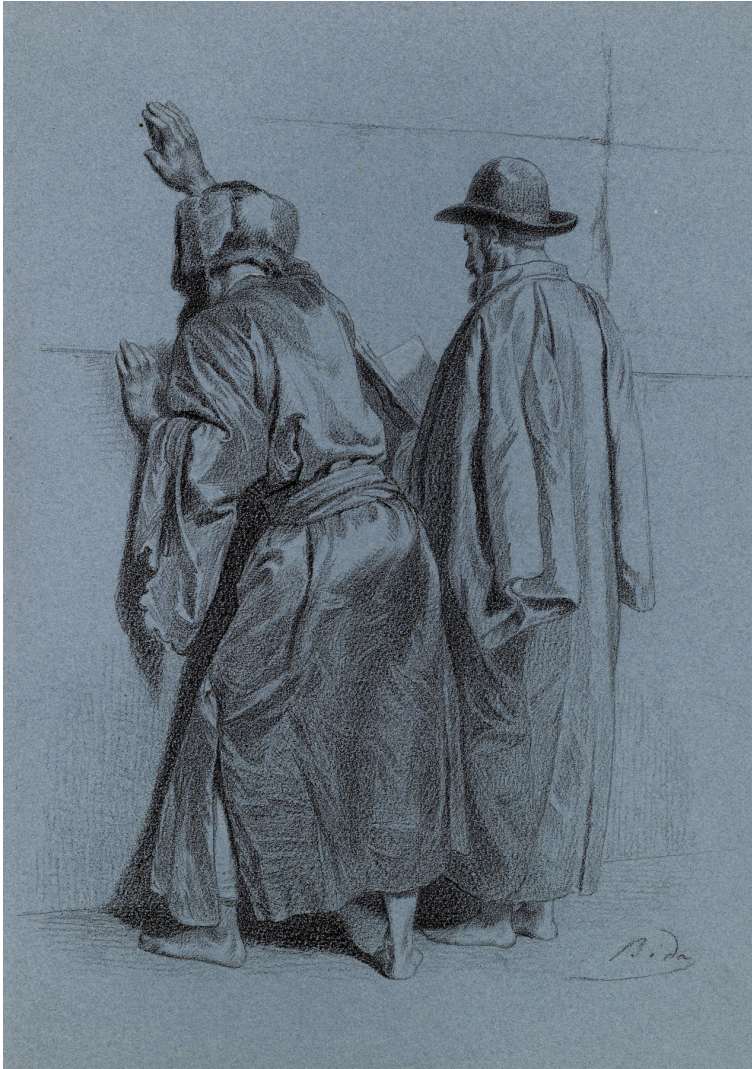
Abb. 5: Alexandre Bida (1813–1895): The Jews at the Wailing Wall. Kreide auf farbigem Papier. 30,8 × 22,1 cm. Um 1850. Walters Art Museum, Baltimore.